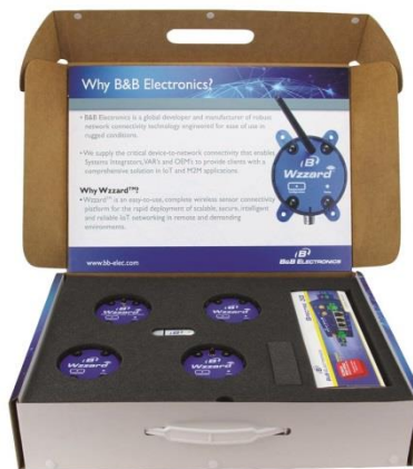
Figure 2. Package Contents

The Wzzard Design and Development Kits come in an enclosure. The contents of the package are shown below: